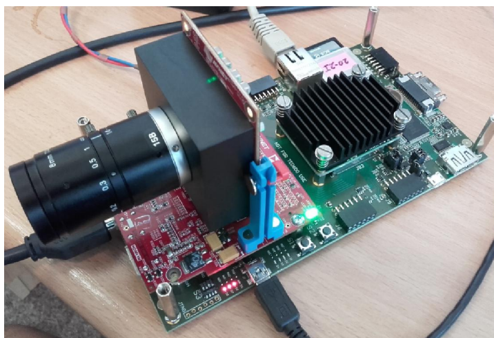
Figure 1: Python camera attached to FMC IMAGEON extension board (red) on Trenz Carrier (green). Trenz SoM with Zynq FPGA is located under passive cooler (black).